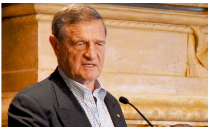
Lt Gen John Sanderson

After more than a decade in Vietnam during the war, and then in Cambodia as commander of the 16,000-strong UN peace-keeping force, Lt Gen John Sanderson knows what it is to face tough situations. Having served five years as Governor of WA, Sanderson was then commissioned to report on Aboriginal disadvantage in WA. His report proved too tough for the Government to accept.