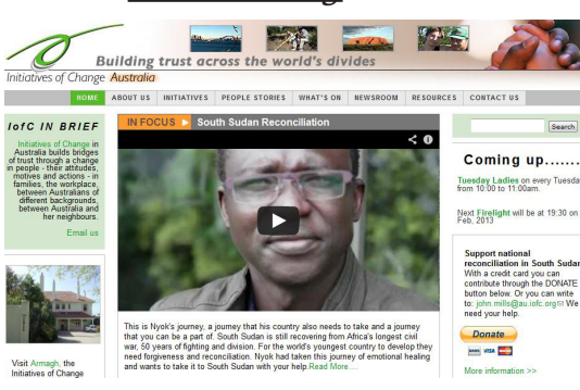
The Initiatives of Change website.