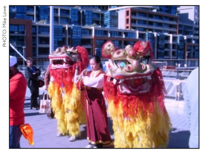
Lion dancers at the Parliament of the World's Religions