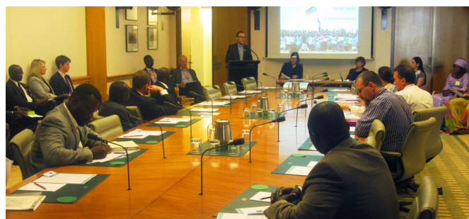
Adam Bandt speaks at the briefing