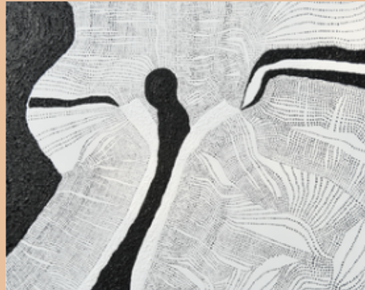
artwork by Uncle Glen